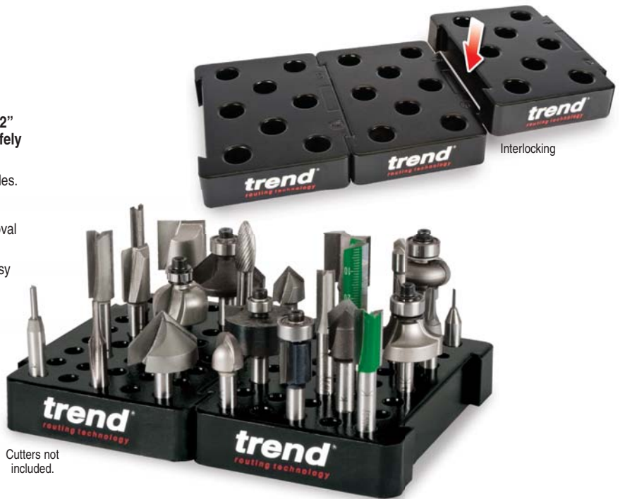
Cutters not included.

CST/127/PK1 £11.51 1/2" shank x four pack. Size: 108 x 79 x 20mm.