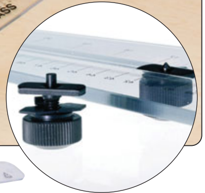
Two types of pivot can be fitted to compass, V-point or 3mm point.