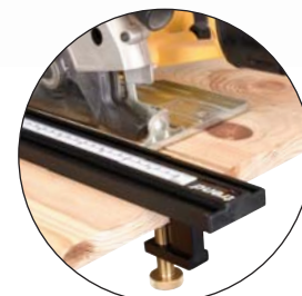
Long clamp kit