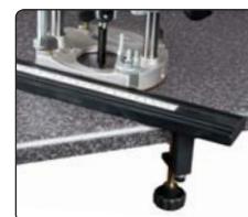
Long pivot clamp securing extrusion to worktop.