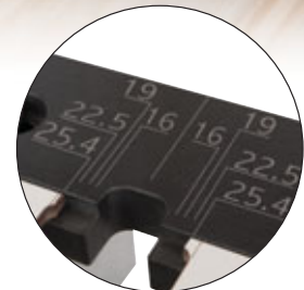
Engraved on top for lock width & on underside to allow set-up for 35mm, 40mm, 44mm & 54mm door widths.