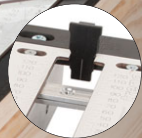
Setting gauge for doors to centre jig & set widths.