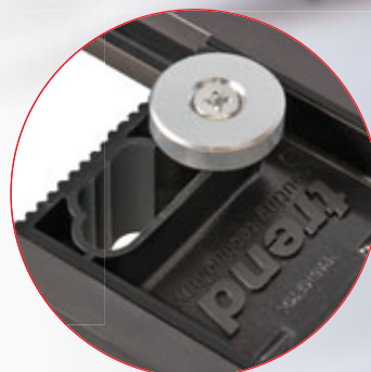
Adjustable stops plus three preset stop positions for 20mm, 25mm & 30mm hinge leaf.