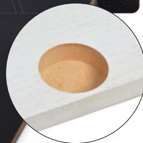
Cuts circular hinge holes 26mmØ & 35mmØ