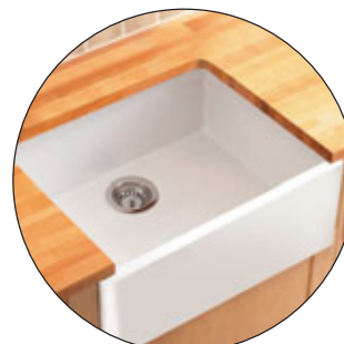
Belfast sink installed