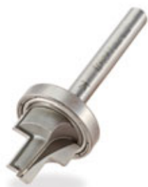
Special TCT router cutter

Unique cutter design with built in depth guiding bearing fitted to shank.