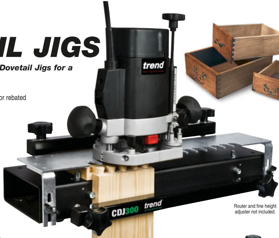
Router and fine height adjuster not included.