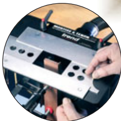
Setting-up square tenon