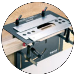
Routing the mortise