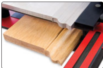
Close-up of cut.