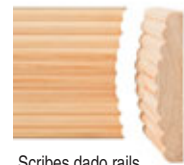
Scribes dado rails.