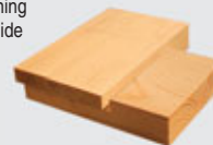
Half lap (halving) joint using tenon slide template.