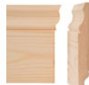
Scribes skirting boards.