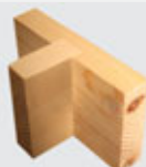
Through housing joint using tenon slide template.