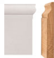
Scribes differing skirting boards.