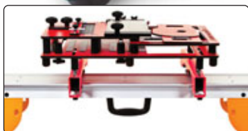
Mounted on the chop saw stand skids with the accessory Quick Mount Kit Ref. SM/MKP.