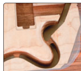
Tags holding mould workpiece in place.