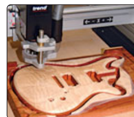
Routing the profile.