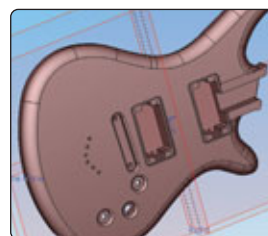
Computer software design.