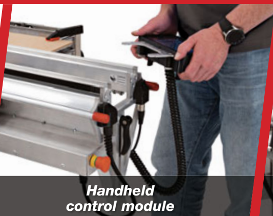
Handheld control module