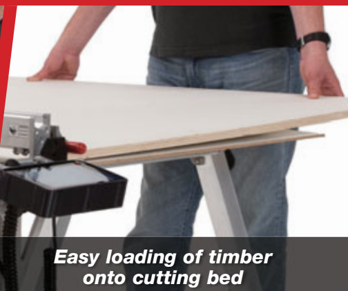
Easy loading of timber onto cutting bed