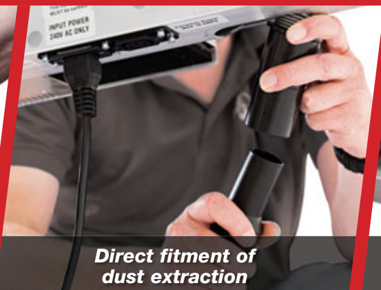
Direct fitment of dust extraction