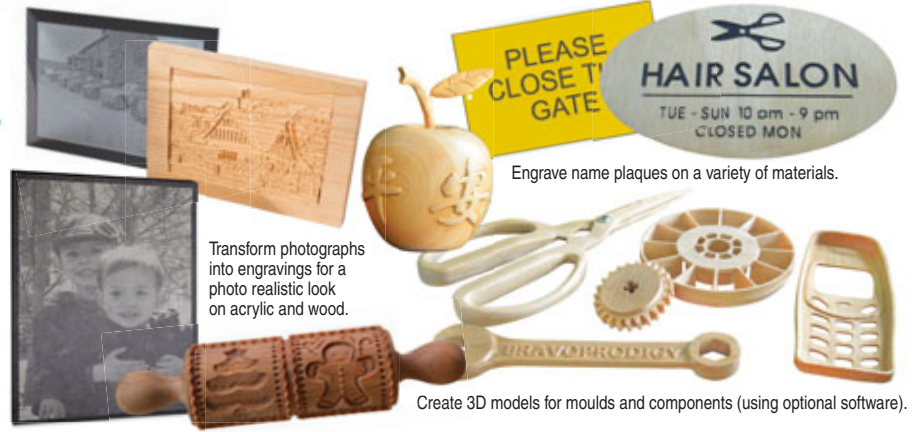
Engrave name plaques on a variety of materials.