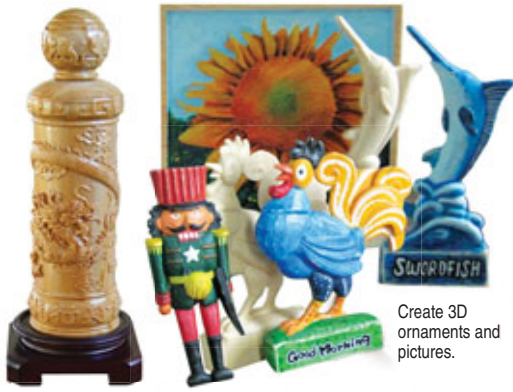
Create 3D ornaments and pictures.