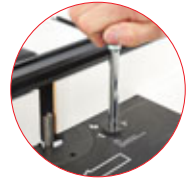
Quick raiser Includes hole for T11's fine height adjuster.