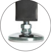
Adjustable feet For uneven surfaces.