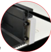
Backfence With edge planing facility.