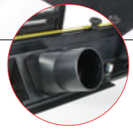
Dust Spout 57mmØ (2-1/4") aperture.