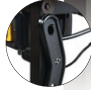
Accessory hooks on front legs.