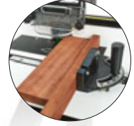
Mitre fence Mitre fence with zeroing and splch block facility.