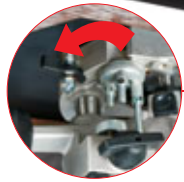
T11 quick release fixing holes Allows T11 to be fitted to the table quickly and removed when used with optional Quick Release Kit.