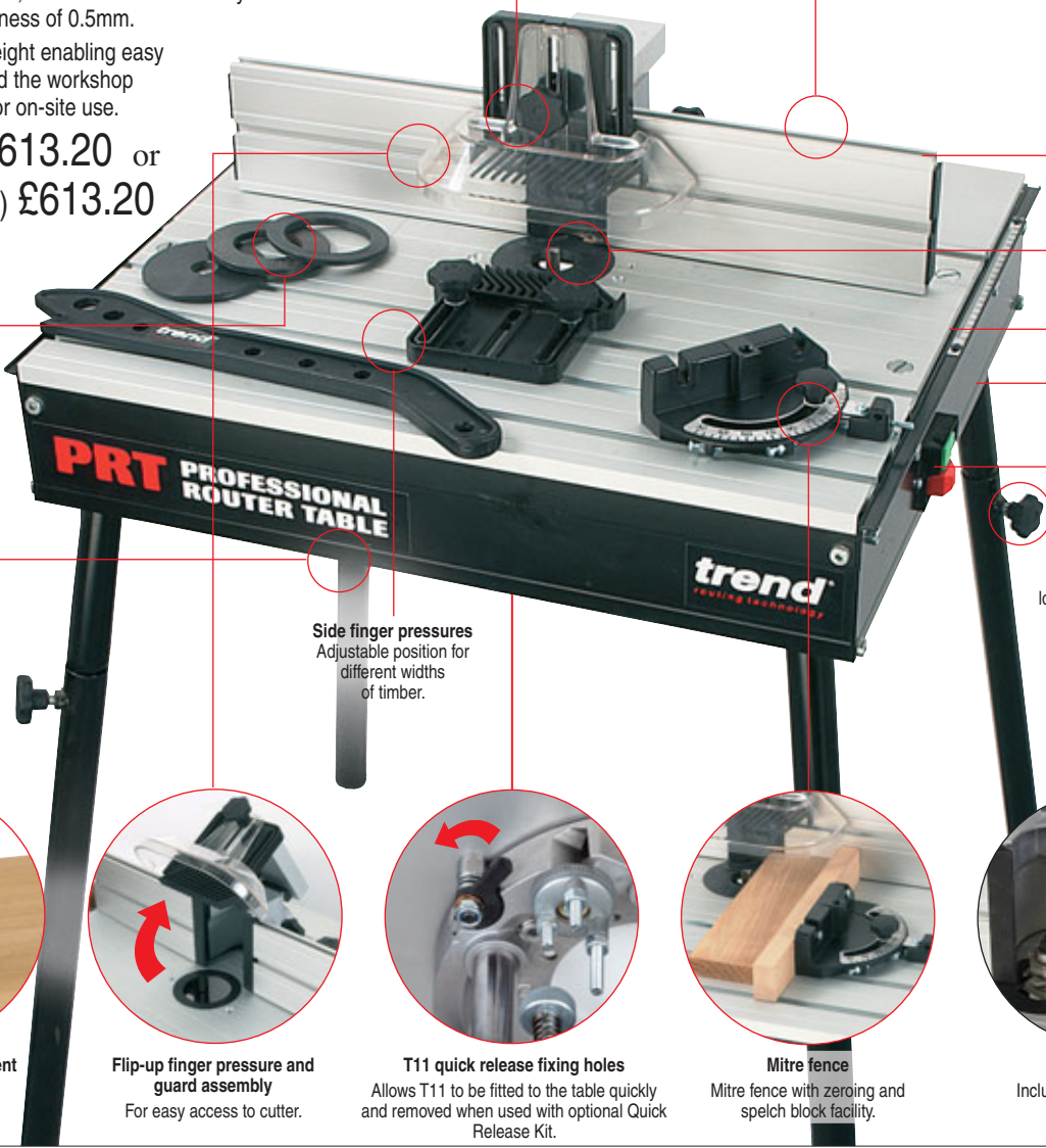
90mmØ aperture For larger panel raiser cutters.