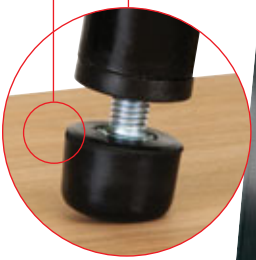
Bench leg level adjustment For uneven surfaces.