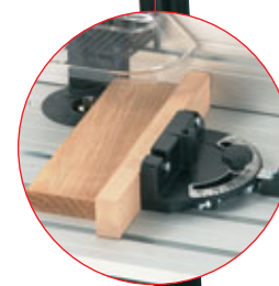
Mitre fence Mitre fence with zeroing and splch block facility.