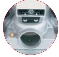
57mmØ (2-1/4") dust spout aperture With freehand lead-on pin park.