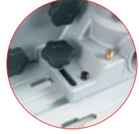
Backfence Quick release 110mm cast aluminium backfence with adjustable aluminium cheeks and squareness adjustment.