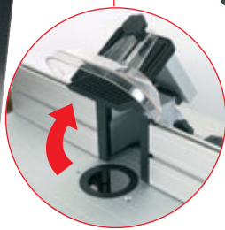
Flip-up finger pressure and guard assembly For easy access to cutter.