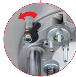
T11 quick release fixing holes Allows T11 to be fitted to the table quickly and removed when used with optional Quick Release Kit.