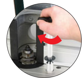
Quick raiser Includes hole for T11's fine height adjuster.