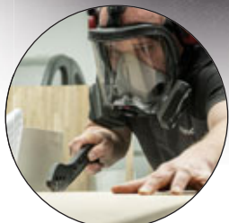
Large panoramic clear polycarbonate visor for superior vision in all tasks.

Twist-on Bayonet Fitting for easy filter positioning and correct fool proof fit.