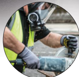
Maximum protection from sparks, swarf and metal grinding dust.