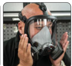
Make a face fit test by blocking the filters and inhaling to check the seal for air leakage.