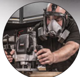
Ultra-low breathing resistance for increased comfort in extended periods of use.