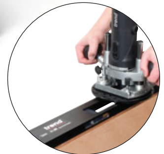
Hinge recessing with a Hinge Jig & Unibase fitted or use Ref. GB/T4/160.