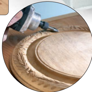
Removable base for shaping & sharpening. Use Burrs & Rasps for grinding & carving, see page 78 for full details.