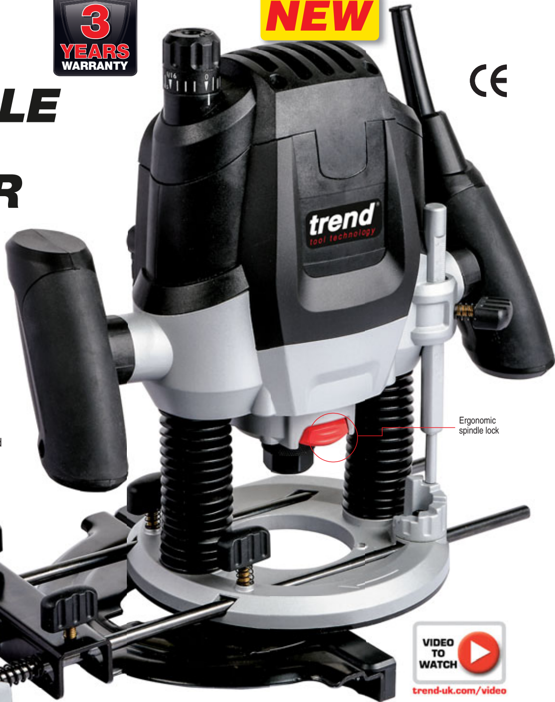
Ergonomic spindle lock