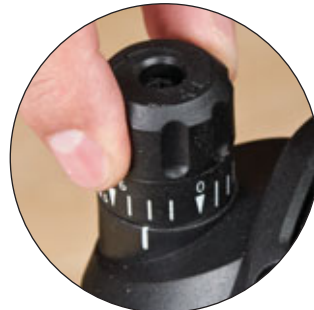
Built in fine height adjuster