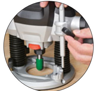
8 stage turret and plunge post