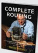
Product Ref. BOOK/CR

An essential read for all router users. Written by Alan Holtham. See page 182 for full details.