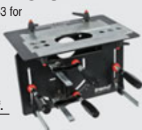
Product Ref. MT/JIG