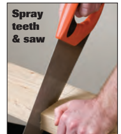
Spray teeth & saw