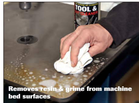
Removes resin & grime from machine bed surfaces