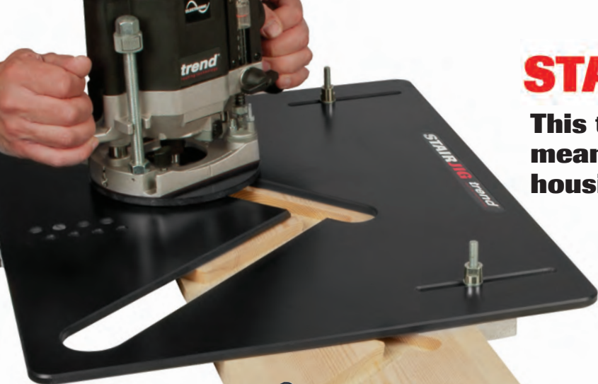
Router not included.

This template jig is a well proven means of routing out closed riser stair housings quickly and accurately.