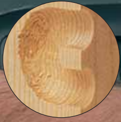
U-Shaped Channels & Holes