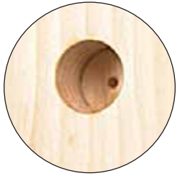
Drills & Counterbores