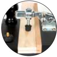
Splench Block Facility