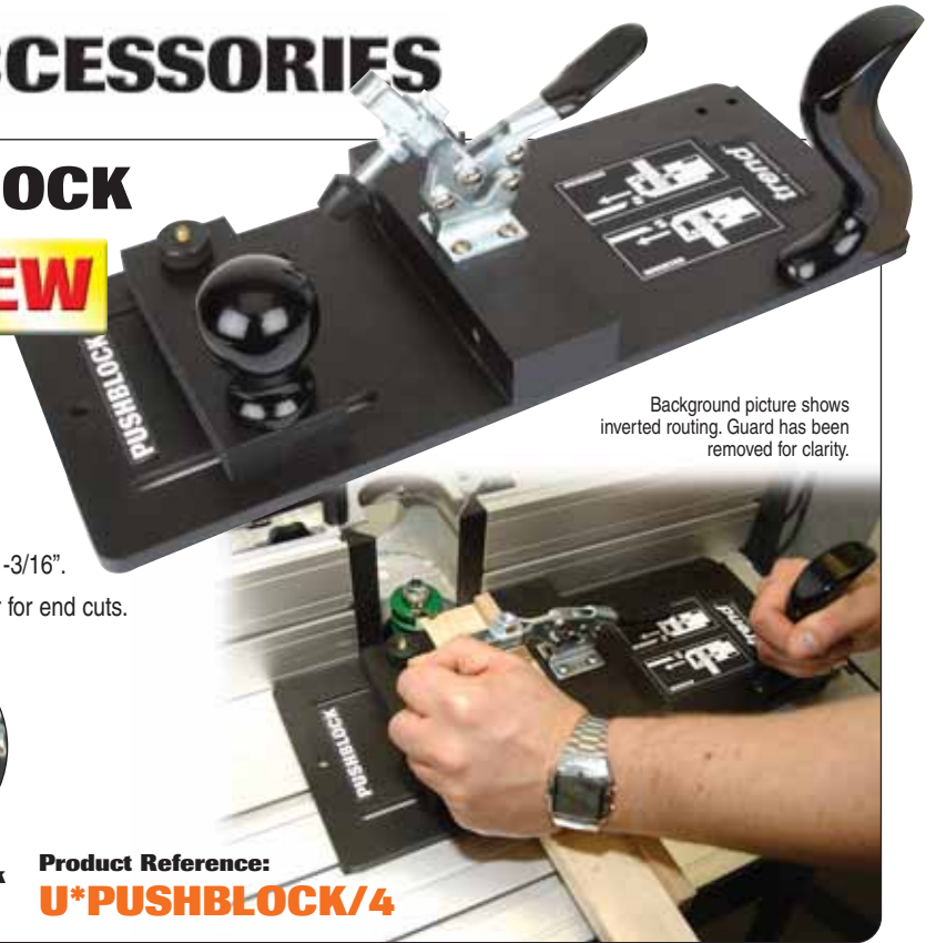
Background picture shows inverted routing. Guard has been removed for clarity.