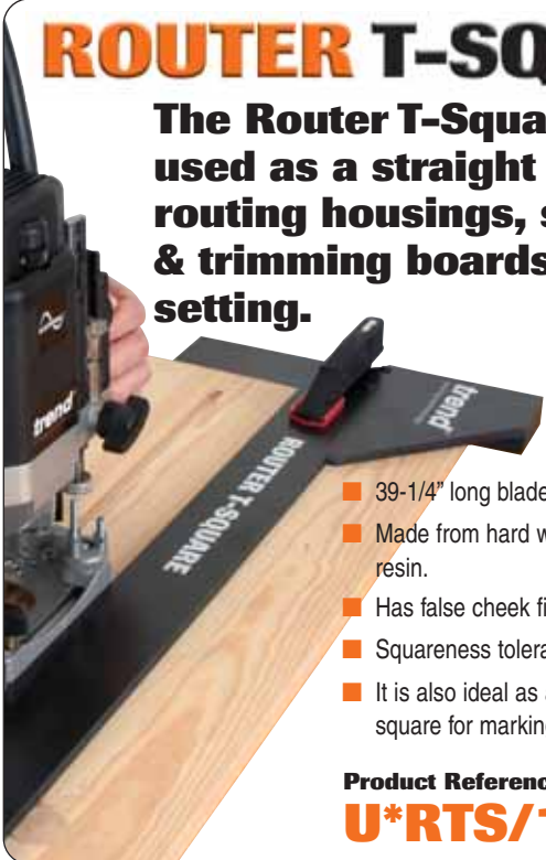
Router and clamp not included.

The Router T-Square can be used as a straight guide for routing housings, squaring & trimming boards and jig setting.