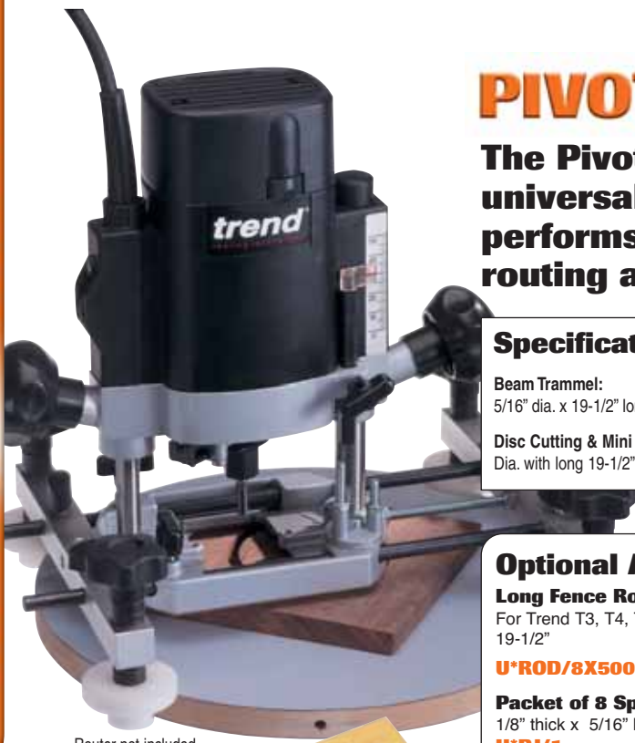
Router not included.