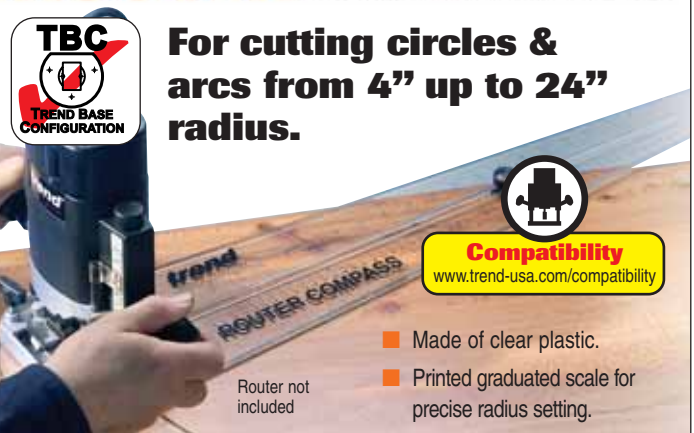
Router not included

For cutting circles & arcs from 4" up to 24" radius.