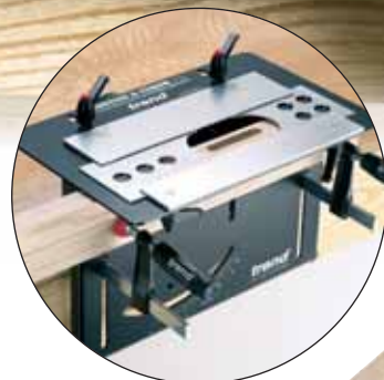
Routing The Mortise

Material thickness min. _____ 1/2" Material thickness max. _____ 2" Width of material max. + _____ 4" Tenon size min. _____ 3/16" Tenon size max. _____ 5/8" Angle tilt compound _____ -10° to 45° + unlimited if wood repositioned