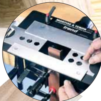
Setting-up Square Tenon