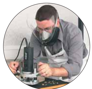
Clip-on Visor Fitted