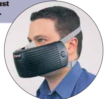
Rubber Face Seal