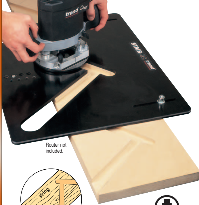
Router not included.