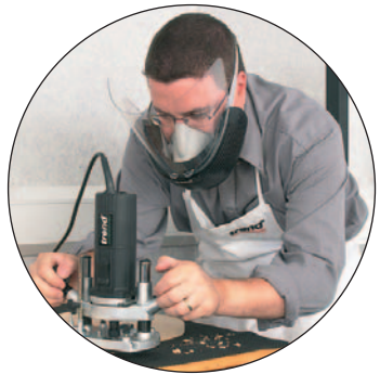
Clip-on Visor Fitted