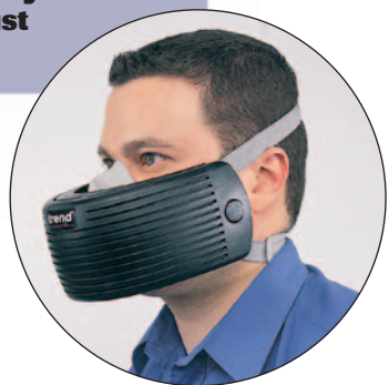
Rubber Face Seal

Optional Accessories: Nuisance Filter U*ACE/2 Active charcoal pre-filter which is fitted over P2 filter, for use on odors and smells at below occupational exposure levels only. Ideal for working with animals. Clip-on Visor U*ACE/3 Eye protection to European Standard EN166, 167, 168. (Medium protection against high - speed particles) Plastic Storage Box U*ACE/6 Ensures dust mask does not get contaminated when not in use.