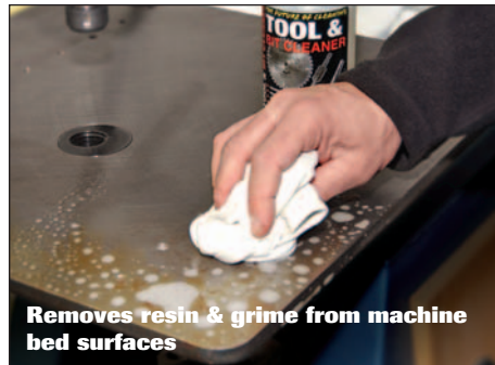
Removes resin & grime from machine bed surfaces