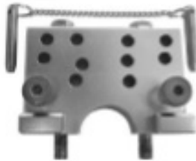
VS4900/2 Support Block Assembly (Exhaust Camshafts) c/w Retaining Bolts (2), Securing Screws (2) and Location Pin Assembly.