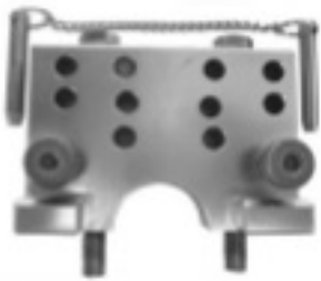
VS4900/1 Support Block Assembly (Inlet Camshafts) c/w Retaining Bolts (2), Securing Screws (2) and Location Pin Assembly.